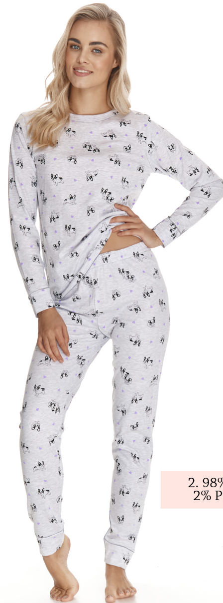
2. 98% COTTON, 2% POLYESTER