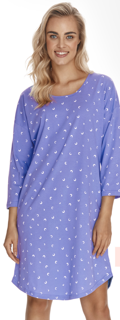
2. 100% COTTON