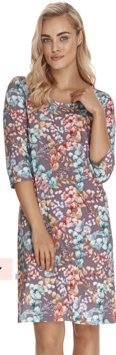
VITA 2797 S-XL 1. 100% COTTON