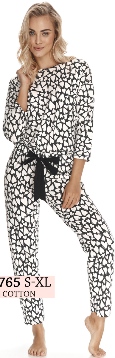
MILANO 2765 S-XL 1. 100% COTTON