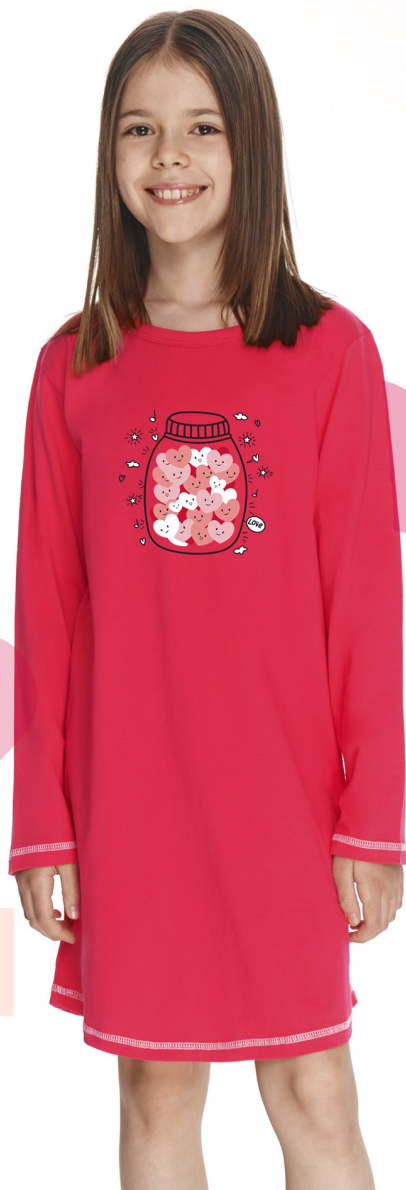
LIVIA 2794 104-140 1. 100% COTTON