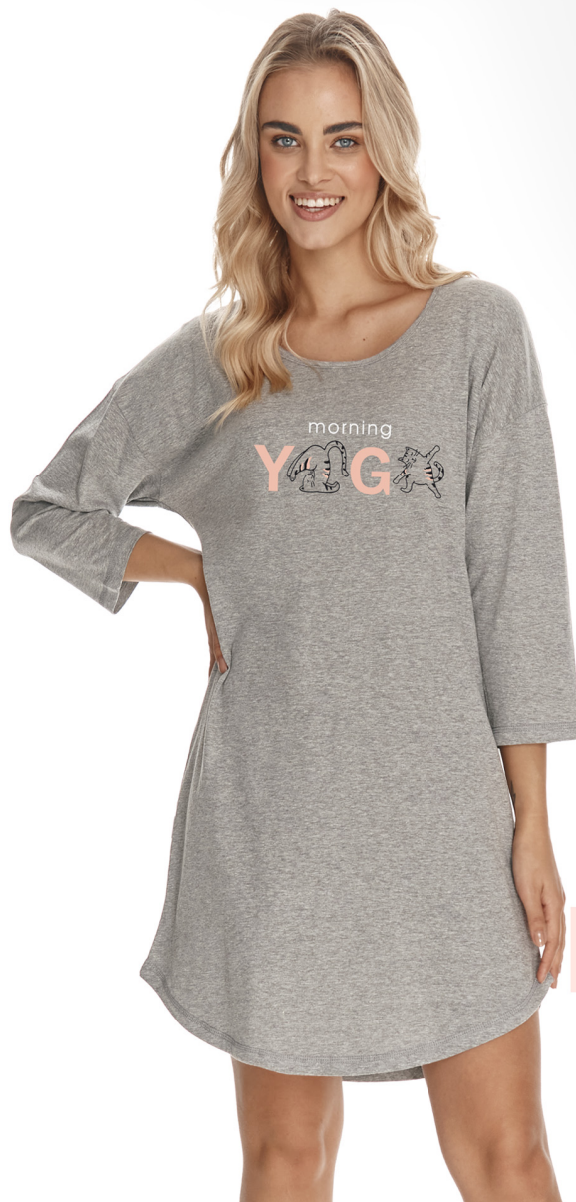
2. 80% COTTON, 20% POLYESTER