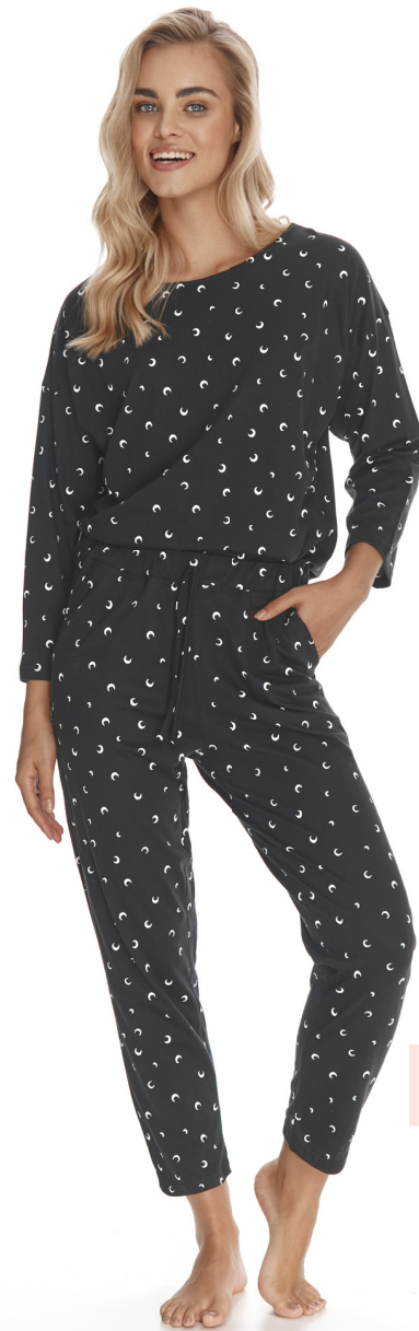
2. 100% COTTON