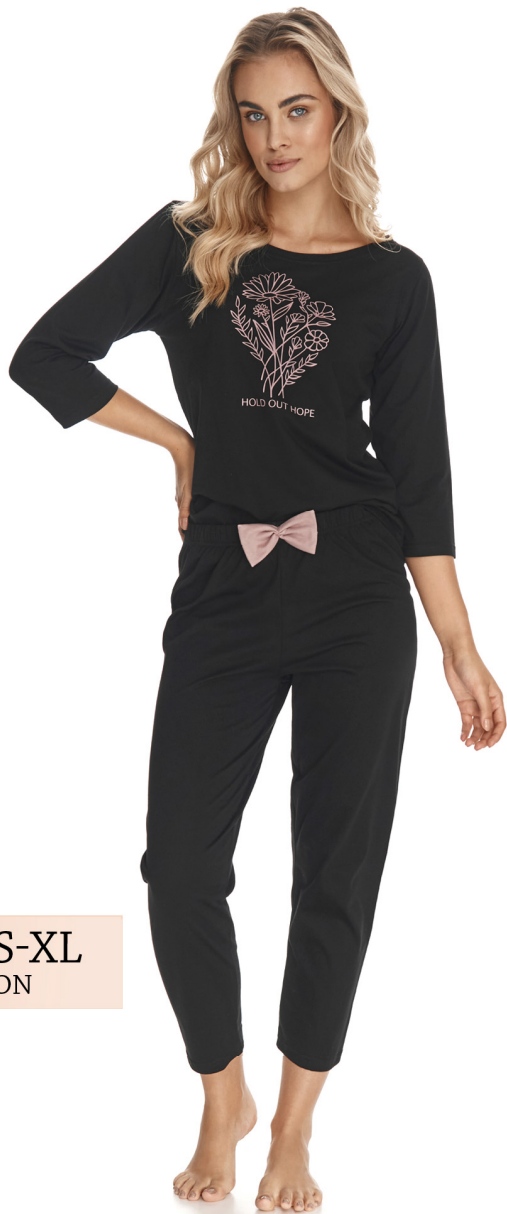
ALMA 2764 S-XL 1. 100% COTTON