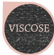
VICTORIA 2774 S-XL 1. 90% VISCOSE, 6% COTTON, ELASTANE 4%