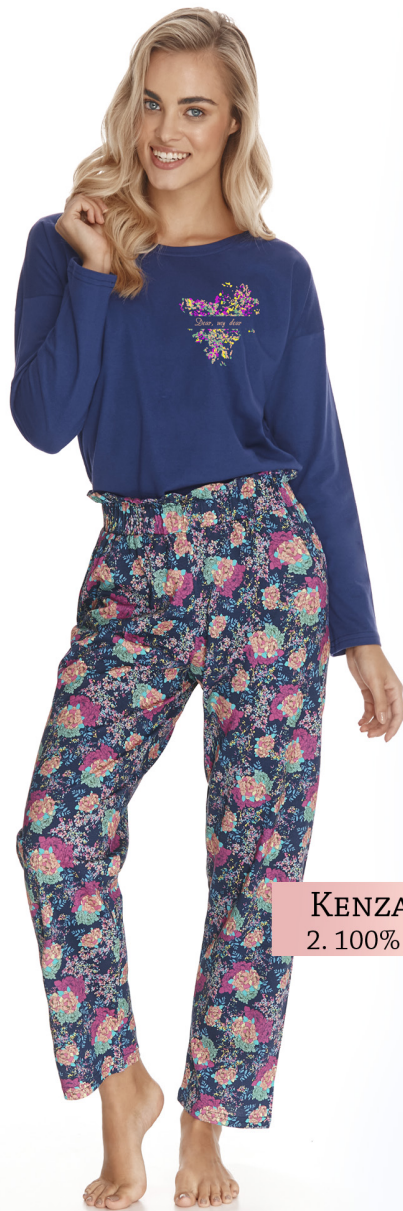
KENZA 2773 S-XL 2. 100% COTTON