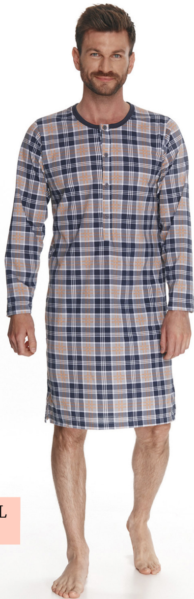
PHILIP 2630 L-2XL 1. 100% COTOON