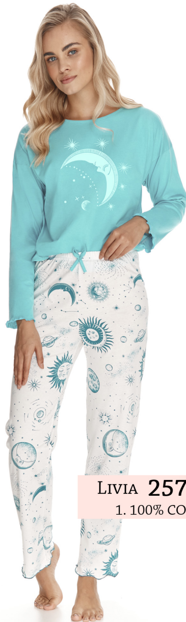
LIVIA 2575 S-XL 1. 100% COTTON