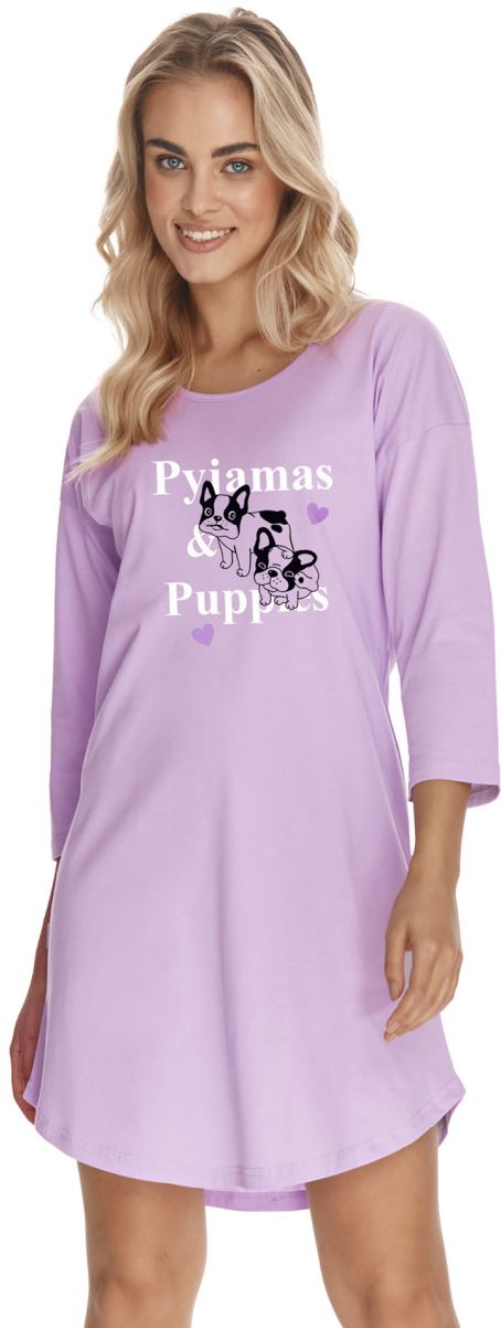
IDA 2776 S-XL 1. 100% COTTON