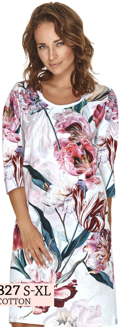
DANIELA 2827 S-XL 1. 100% COTTON