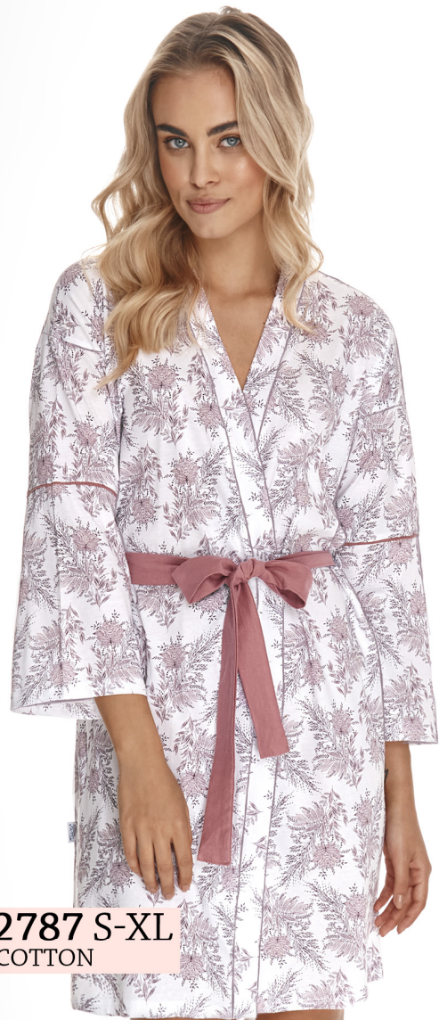
GIORGIA 2787 S-XL 1. 100% COTTON