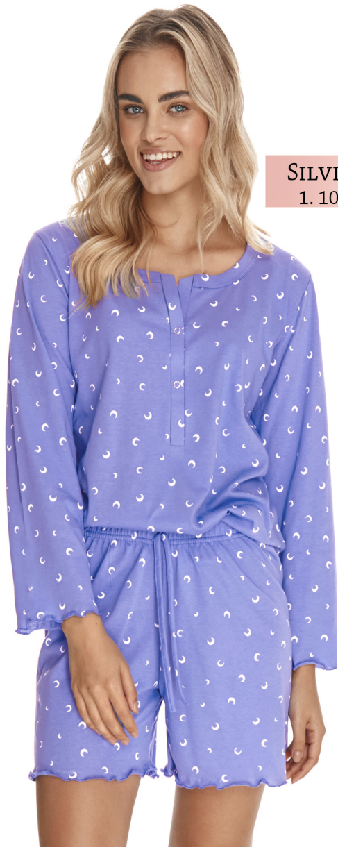
SILVIA 2779 S-XL 1. 100% COTTON