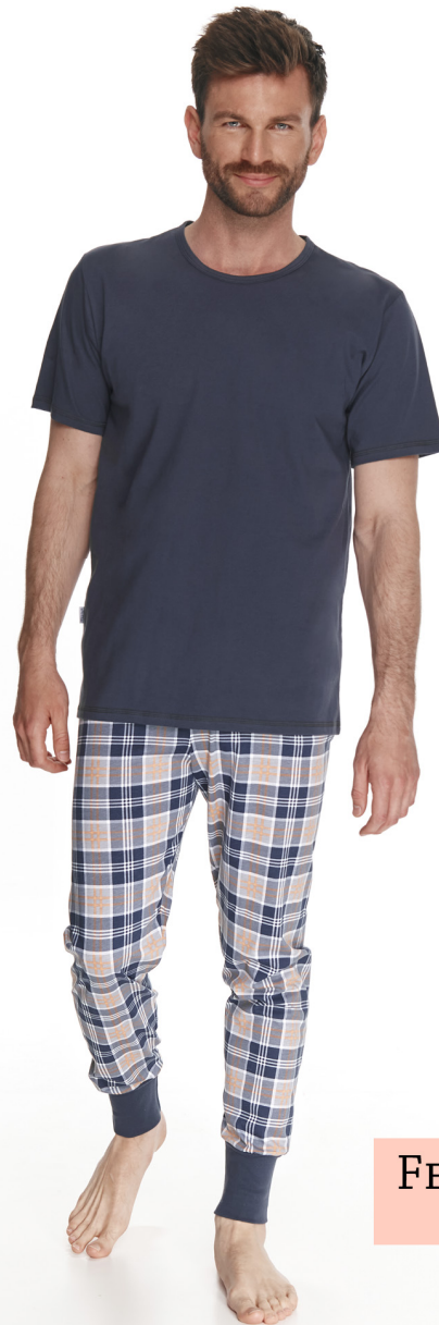
FEDOR 2731 M-2XL 1. 100% COTTON