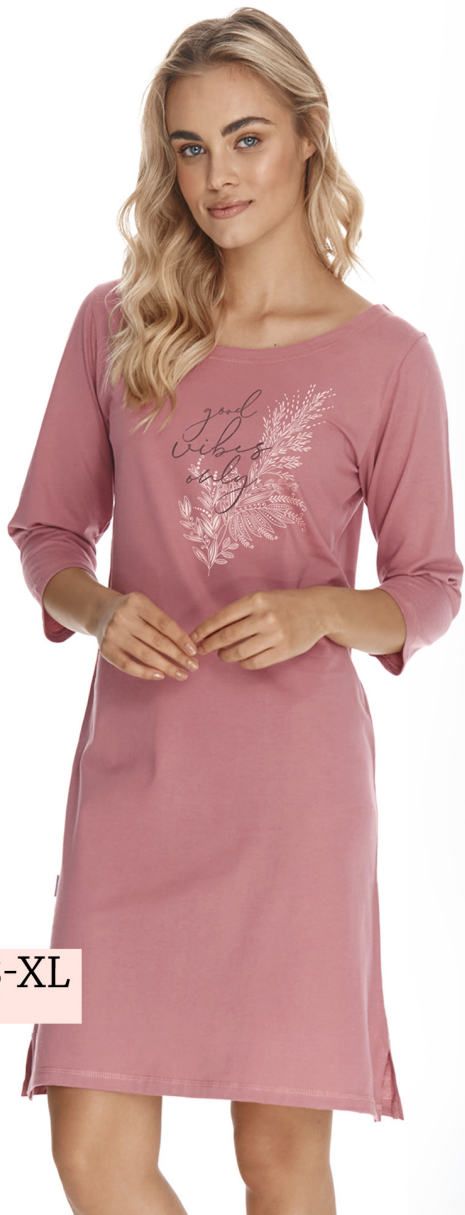
GIORGIA 2767 S-XL 1. 100% COTTON