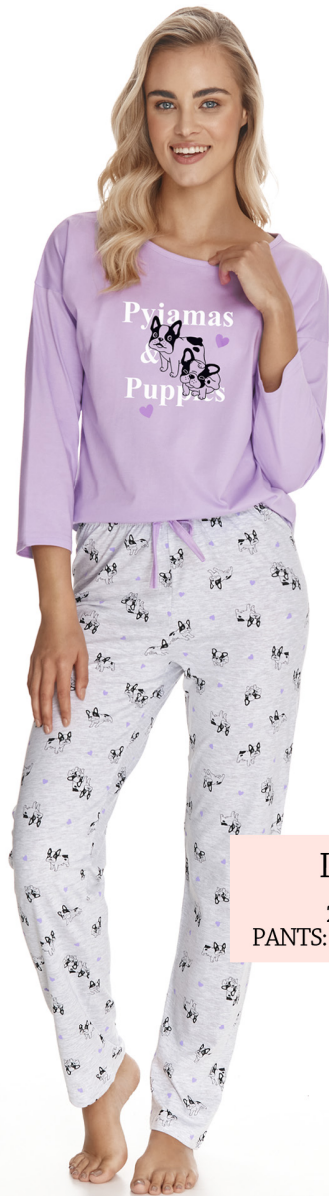
IDA 2581 S-XL 2. TOP: 100% COTTON, PANTS: 98% COTTON, 2% POLYESTER