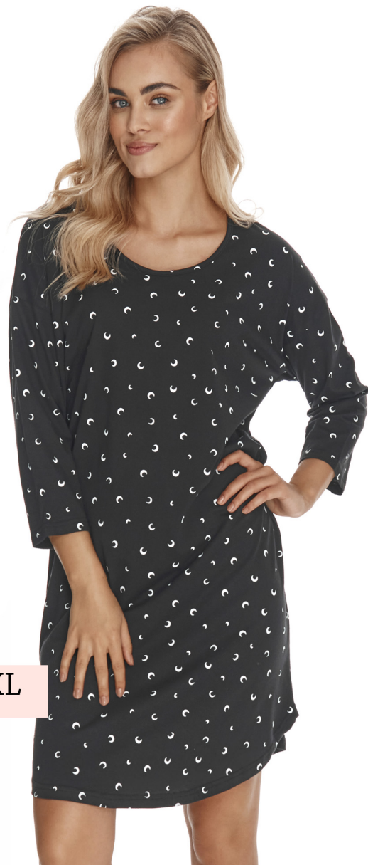
RAISA 2778 S-XL 1. 100% COTTON