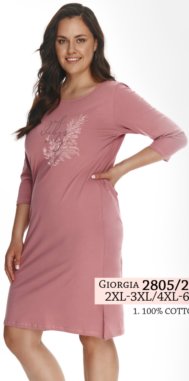
GIORGIA 2805/2806 2XL-3XL/4XL-6XL 1. 100% COTTON