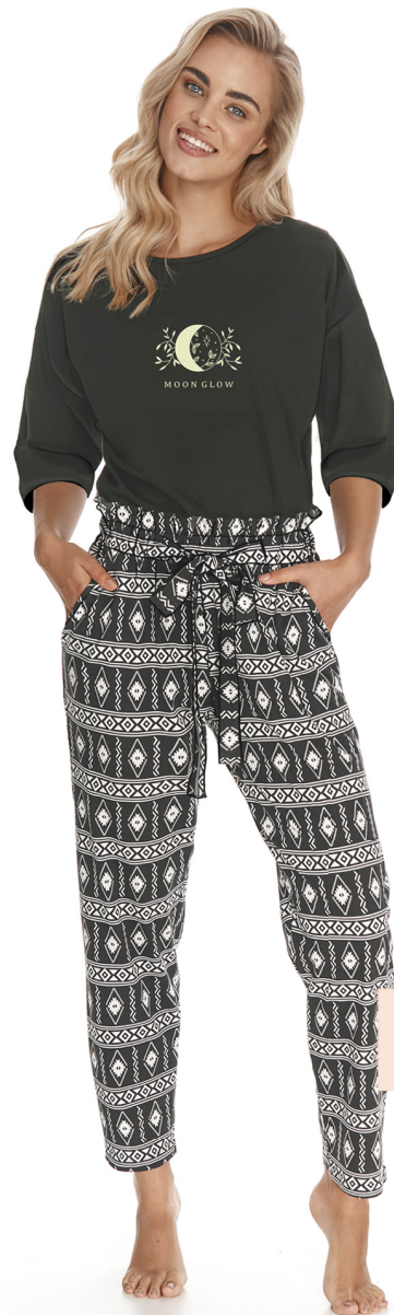
CHANEL 2768 S-XL 1. 100% COTTON