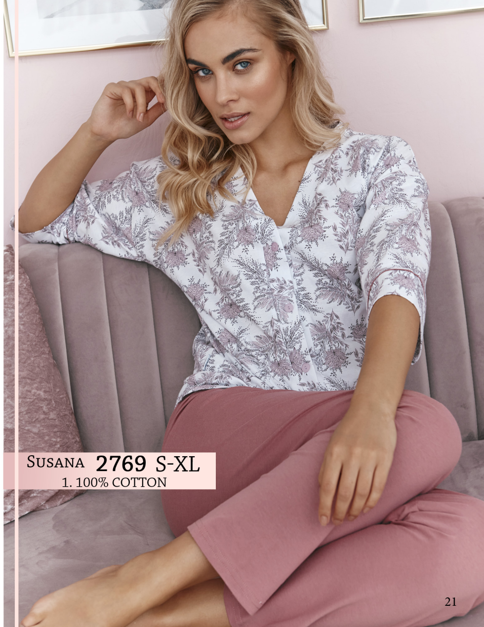
SUSANA 2769 S-XL 1. 100% COTTON