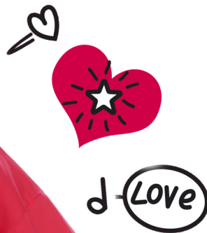
LIVIA 2649 146-158 1. 100% COTTON