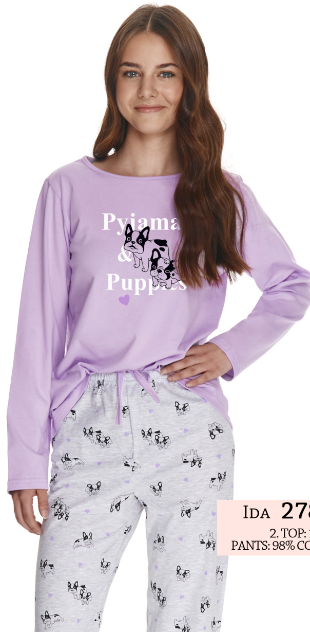
IDA 2784 146-158 2. TOP: 100% COTTON, PANTS: 98% COTTON, 2% POLYESTER